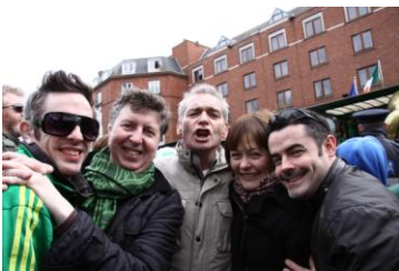
St Patrick's Parade

It was great night, with members from all around the county to attending and joining a very special birthday celebration.